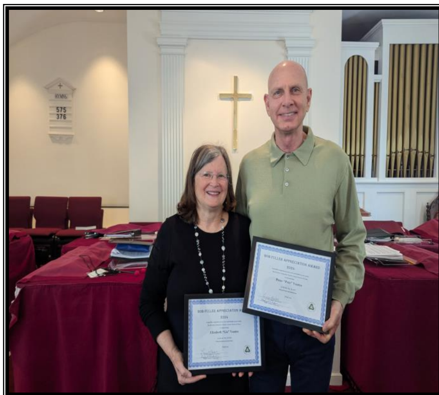
The 2024 Bob Fuller Award honorees. See page 4 for details on this amazing couple and their “gifts.”

Connecting to God ~ Nurturing Community ~ Discovering how our Lives Make a Difference