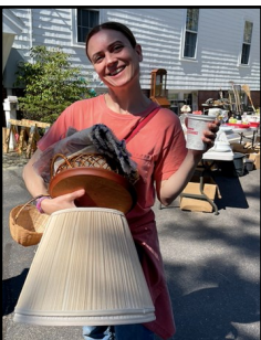
and made shoppers happy.....