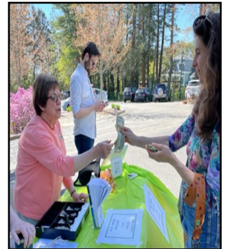
...and we collected money.....