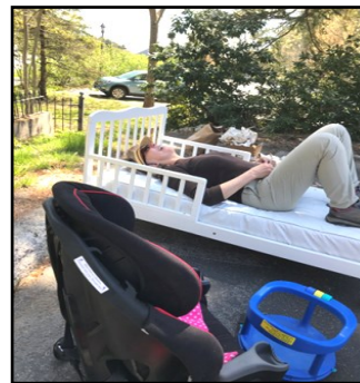
...and then we rested!

It was a hot day, but was good fellowship and community building, and we should probably do it every year!