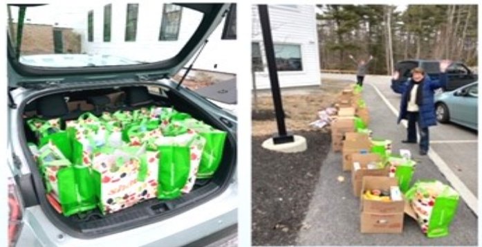
A great morning with the falmouth food panty!